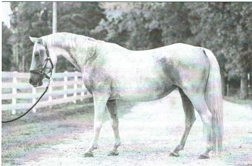
Pictured: Castellana, LRF Alum

Most recently, I have been focusing much of my energy on reproduction and trying to help preserve the Lipizzan breed in the United States. I have been selective as to the mares that are brought into my herd. I'm primarily focusing on quality not quantity, though my feed bill suggests otherwise.