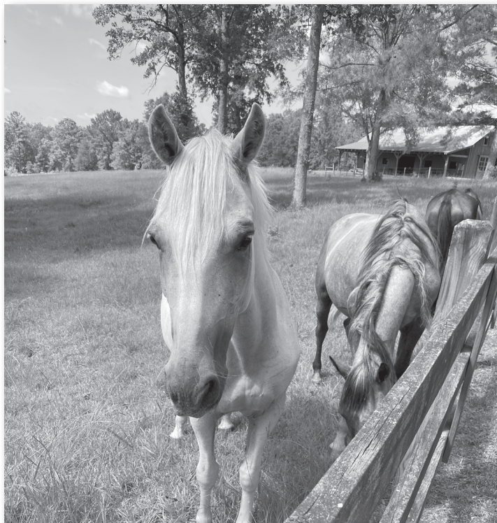
Castellana & her pasture mates